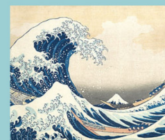
The Great Wave Off Kanagawa by Hokusai